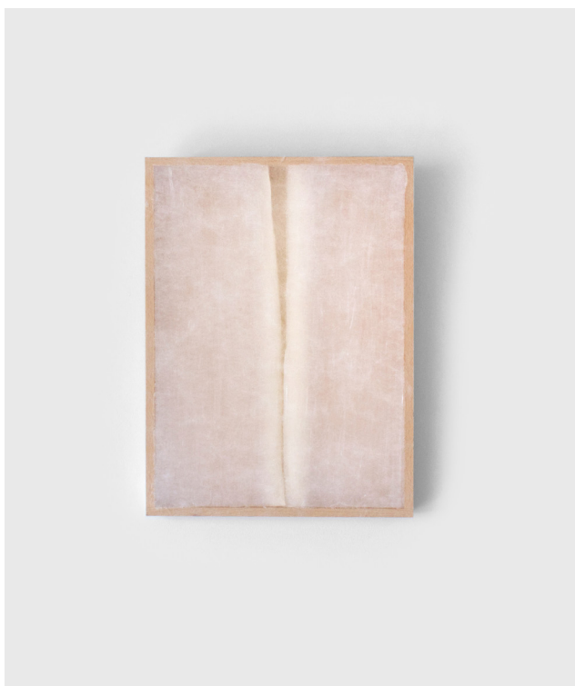
Marija Rinkeviciute, From within, 2022, distemper, paper, transparent fabric, wood, 30 x 40 x 3 cm