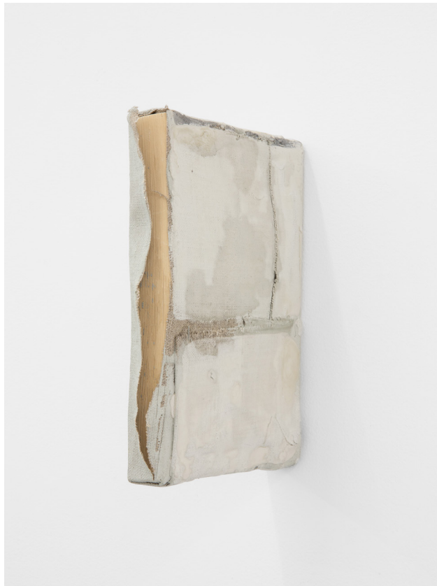
Marija Rinkeviciute, Ghost book, 2022, Distemper on linen on found book, 24 x 3,5 x 16 cm