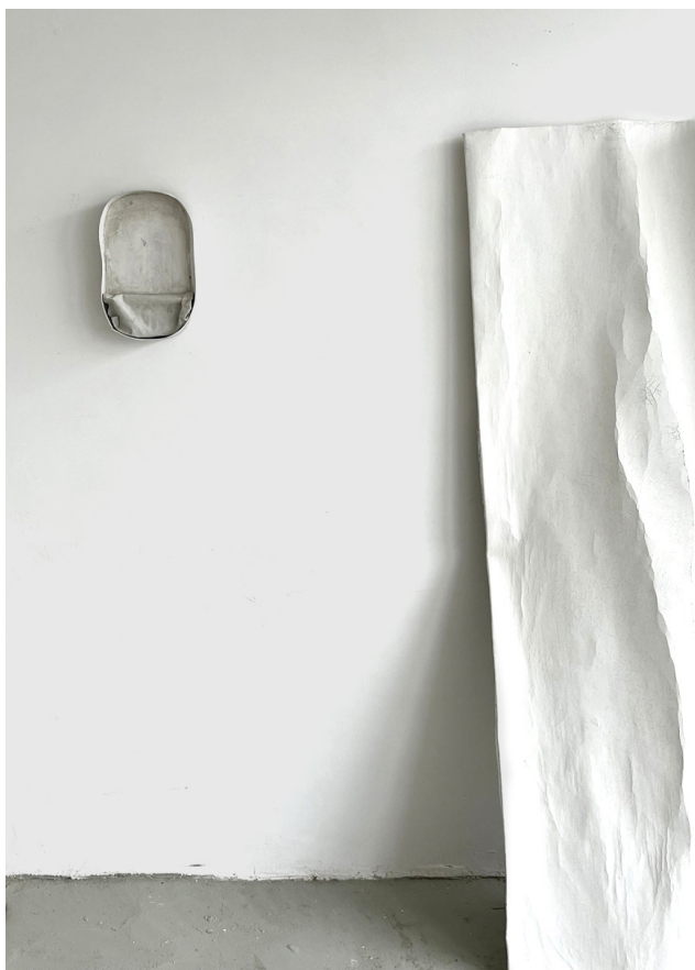
Marija Rinkeviciute, exhibition view «Silent Seeing» at Artifex, Vilnius (LT), 2024