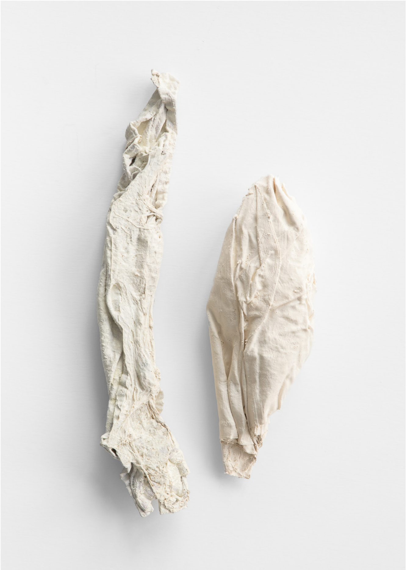
Marija Rinkevičiūtė, Apparitions, 2025, Pigment, latex, distemper on linen and cotton, 50 x 9 x 4 cm and 34 x 13 x 7 cm