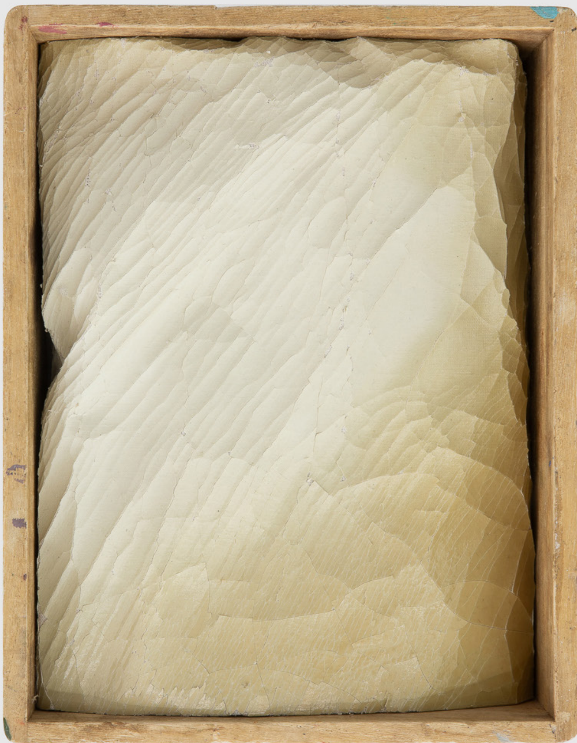
Marija Rinkevičiūtė, Box painting, 2025, Distemper on linen in a found wooden box, 29 x 21 x 18 cm