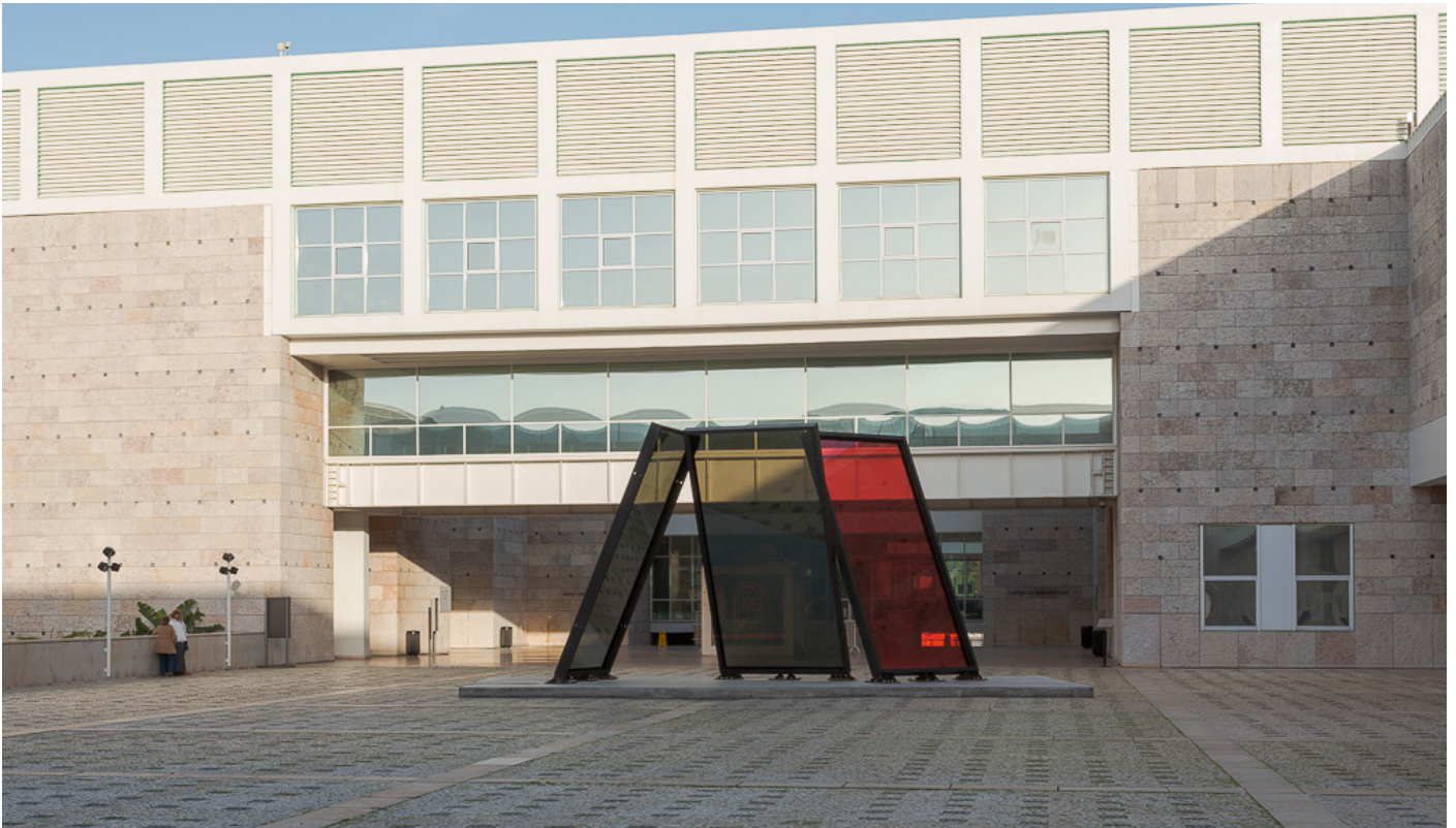
Exhibition view of Saudade, China e Portugal – Arte Contemporânea at Museu Coleção Berardo, Lisbon (PT), 2018

Born in 1957 in Porto (PT) Lives and works in Lisbon (PT)