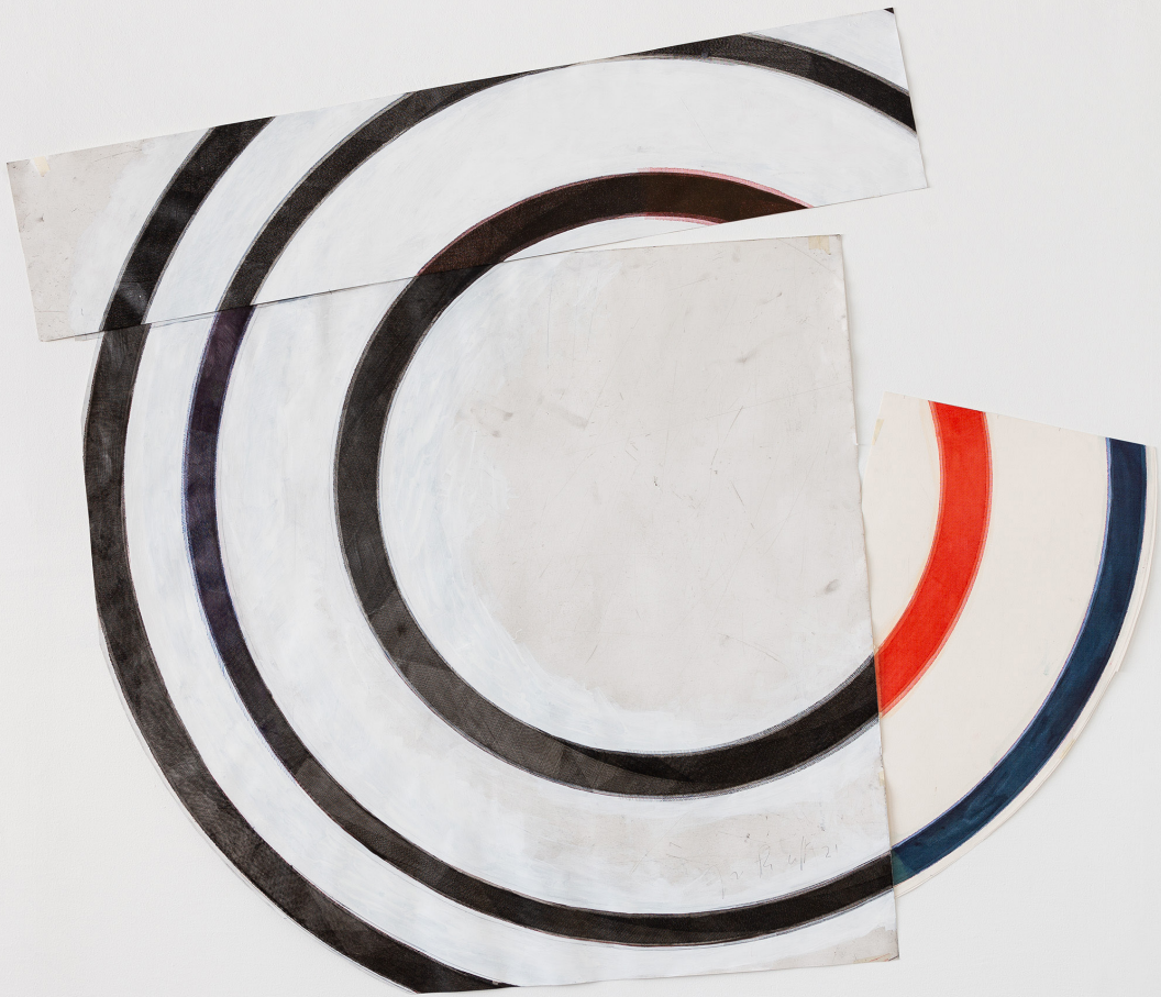
José Pedro Croft, Untitled, 2021, Gouache, varnish, Indian ink and collage on etching, 172 x 189 cm