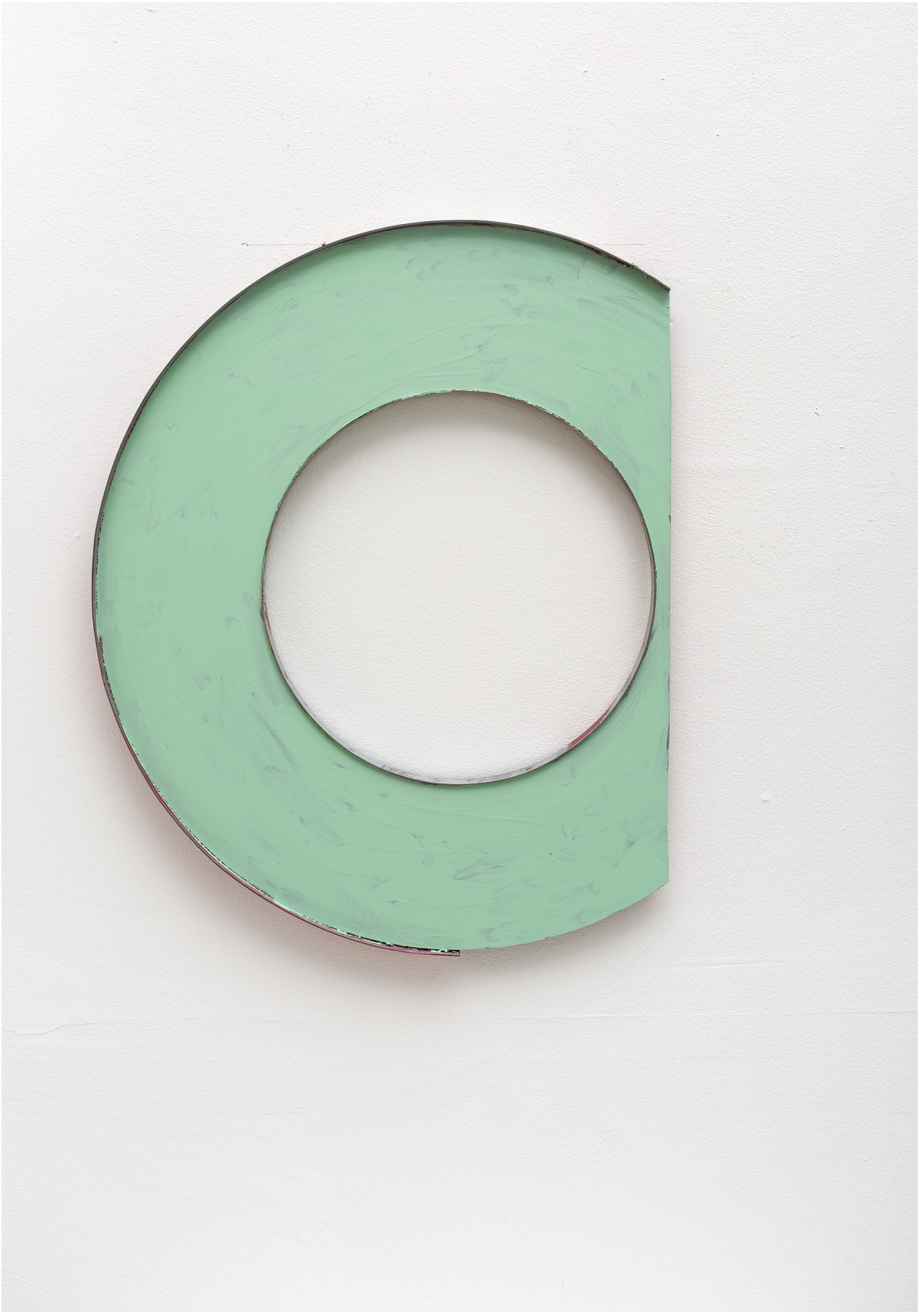
José Pedro Croft, Untitled, 2023, Painted iron, 62 x 48,5 x 5 cm