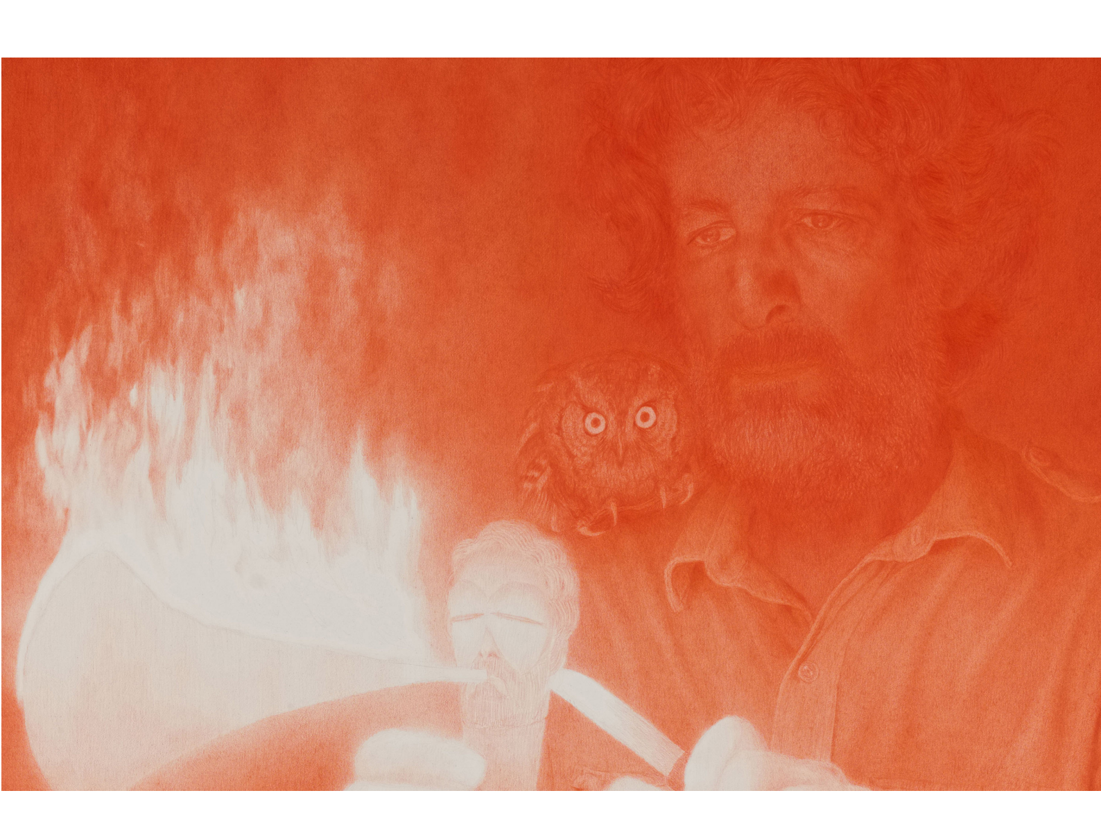
Pedro A.H. Paixão, Playing With Fire , 2023, Vermillion colored pencil on paper, 76 x 56 cm (detail)