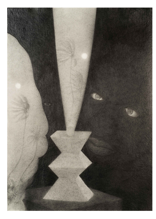
Pedro A.H. Paixão, The Huricane, 2017, Graphite on paper,