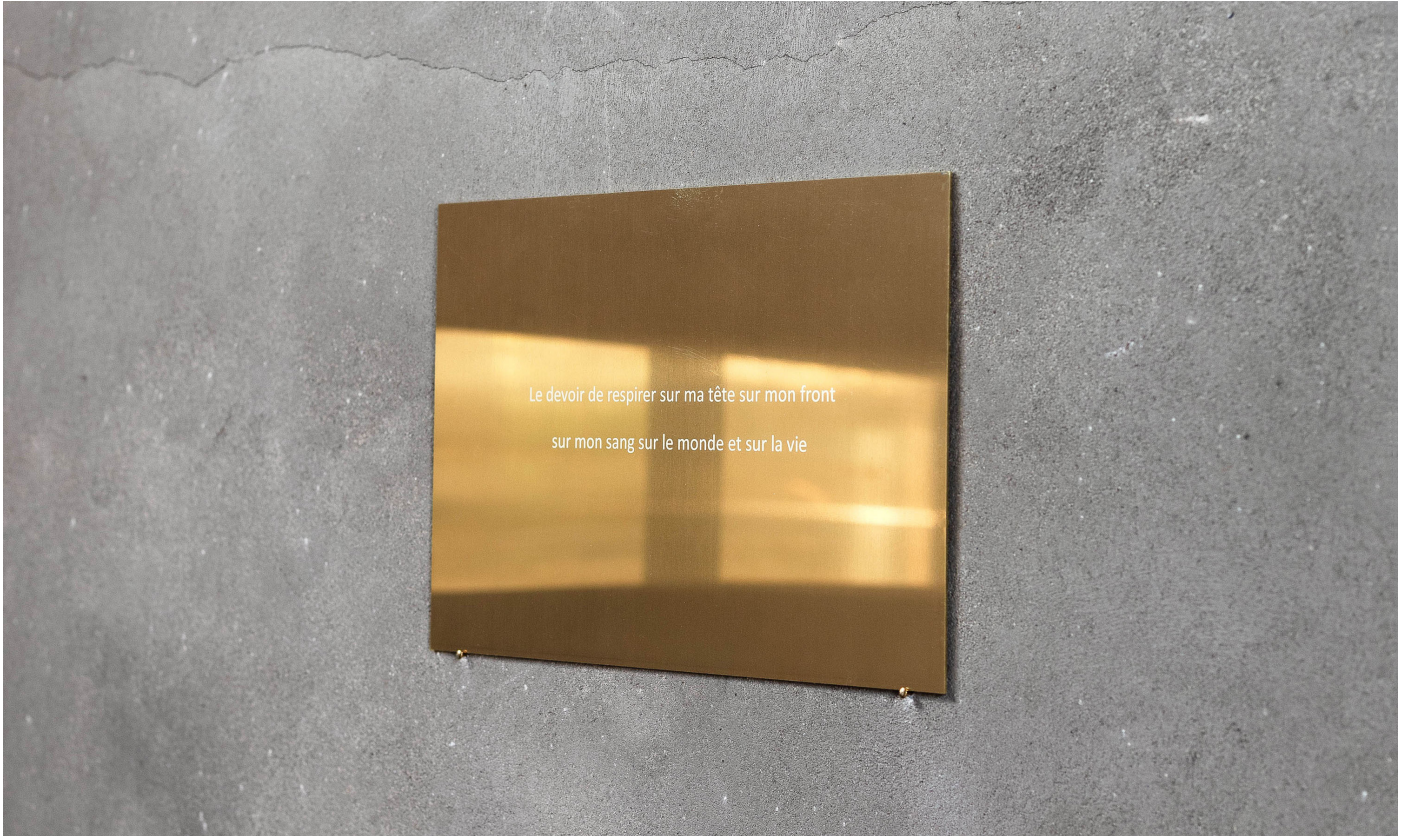
Michèle Magma, «Sonographies L'Acte de Respirer», 2022, engraved messing plates, 60 x 20 cm x 30 cm

yellow, ductile, malleable alloy results from combining copper and zinc, which are both minerals mined in the DRC. The smooth and polished alloy reflects light and our reflection. It questions us. As it is often the case in Michèle Magma's work, the drawings and the words respond to one another in several different languages (French, Swahili, Lingala, Kikongo).