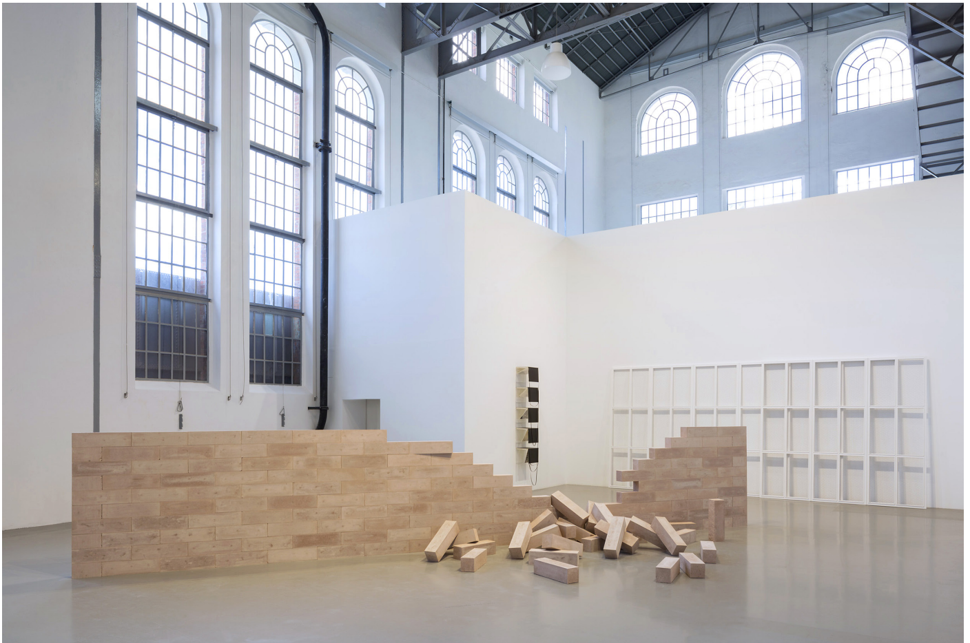
Exhibition view of «From archives to matter, to construction», 2017, Museum of Art, Architecture and Technology, Lisbon, (PT)

Born in 1962 in Montijo (PT) Lives and works in Lisbon (PT)