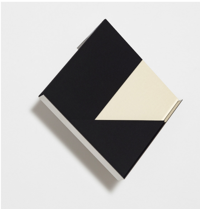
Fernanda Fragateiro, overlap (black and white) , 2, 2020, Polished stainless steel and manufactured notebooks with fabric cover, 50 x 50 x 7 cm