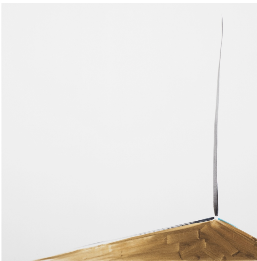
Panos Papadaopoulos, Corner and floorboards, 2018, Oil on canvas, 150 x 150cm