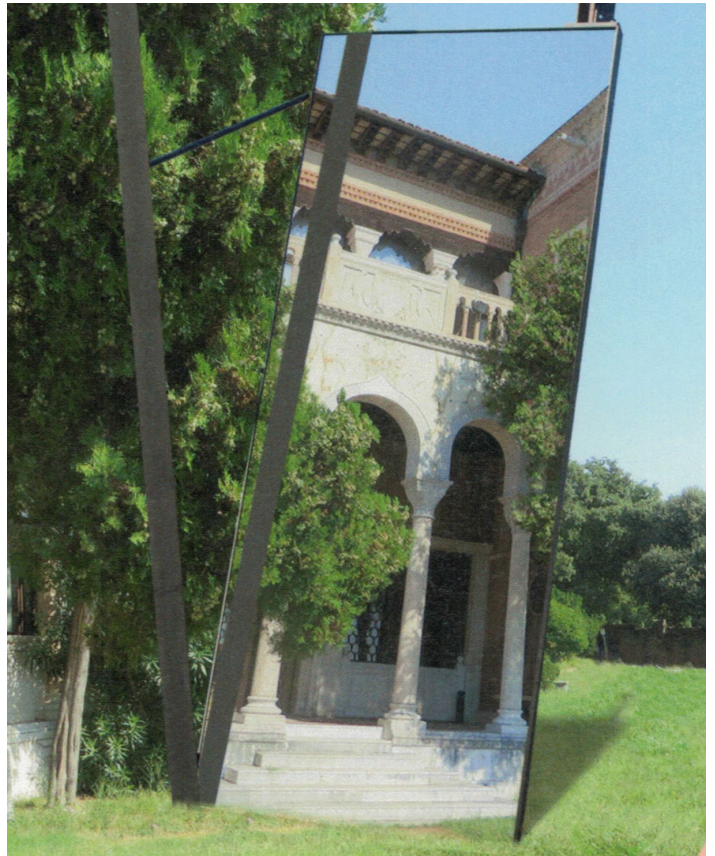
Exhibition view of Medida Incerta at Villa Hériot in Venice, 2017

Having trained as a painter, his work has an intimate connection with the line, drawing and engraving, from which the conceptualization of three-dimensional, large-scale objects arises. José Pedro Croft uses sculpture, the examination of its limits and the exploration of its possibilities, or indeed its impossibilities, as a springboard into the field of action. Thus he goes beyond the threshold