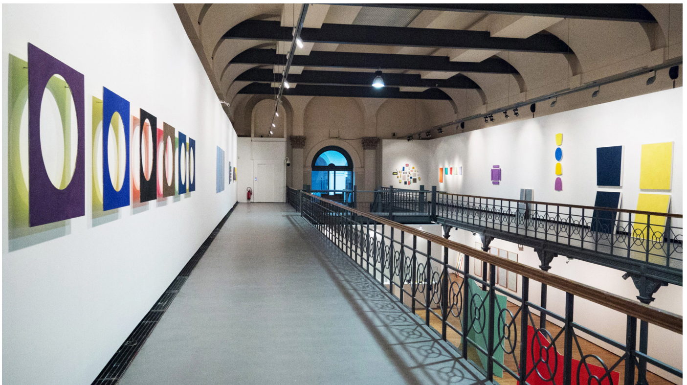
Bernard Villers, exhibition view of «La Couleur Manifeste» at Le Botanique, Brussels (BE)