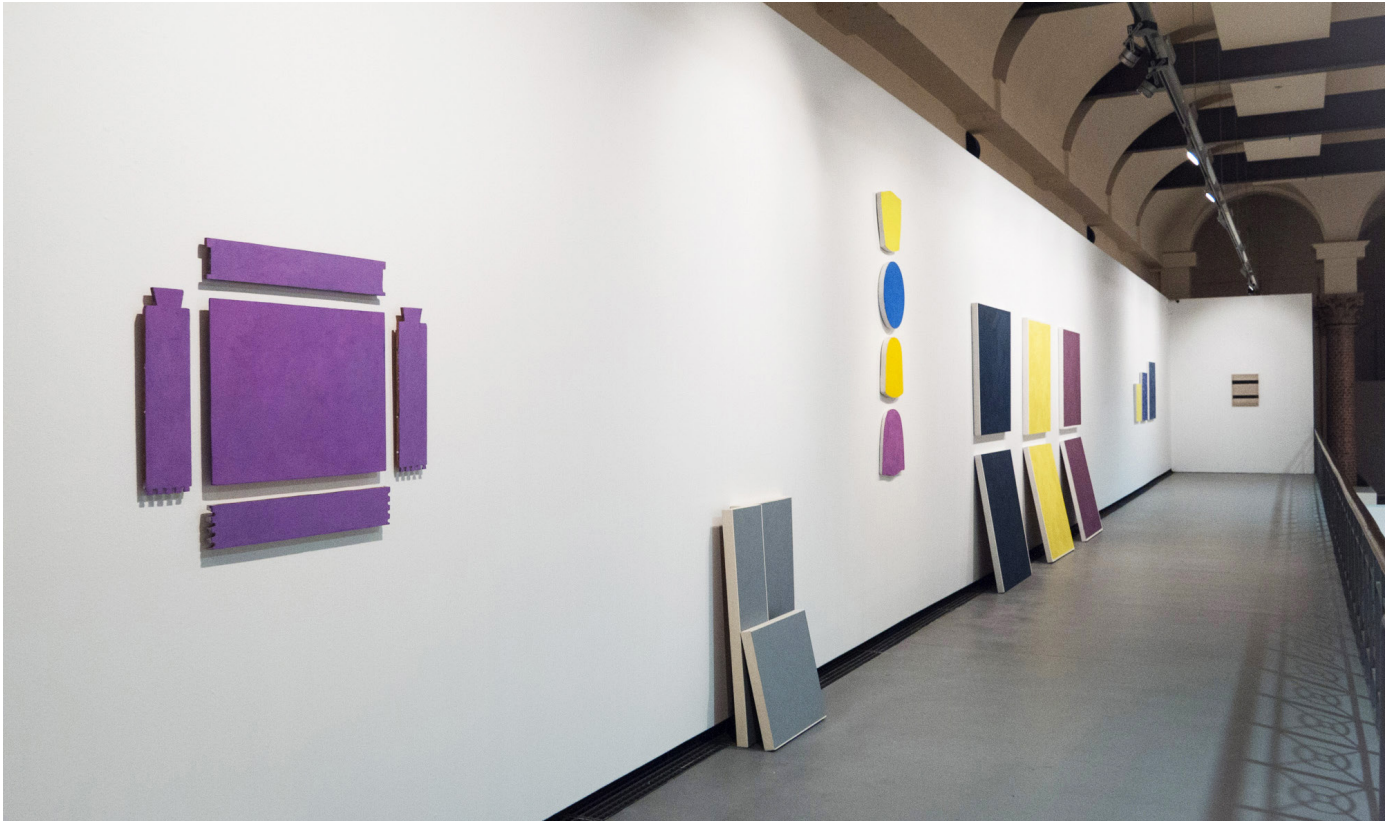
Bernard Villers, exhibition view of «La Couleur Manifeste» at Le Botanique, Brussels (BE), ©