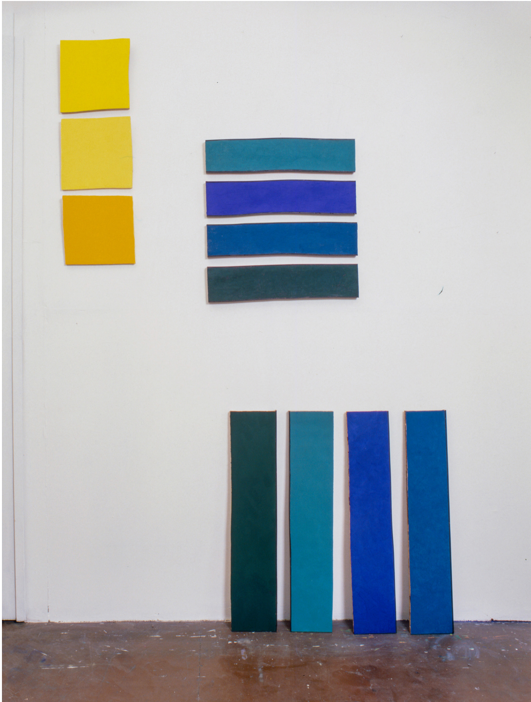
Bernard Villiers, 3 jaunes, 2 fois 4 cobalts , 1990, Tempera sur bois, variable dimensions