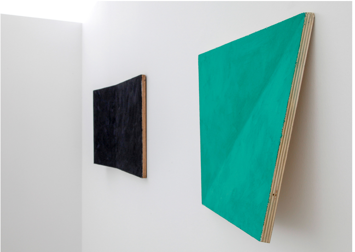
Bernard Villiers, Inclinaison , 2010, tempera, toile, bois, 40 x 35 x 5 cm (each)