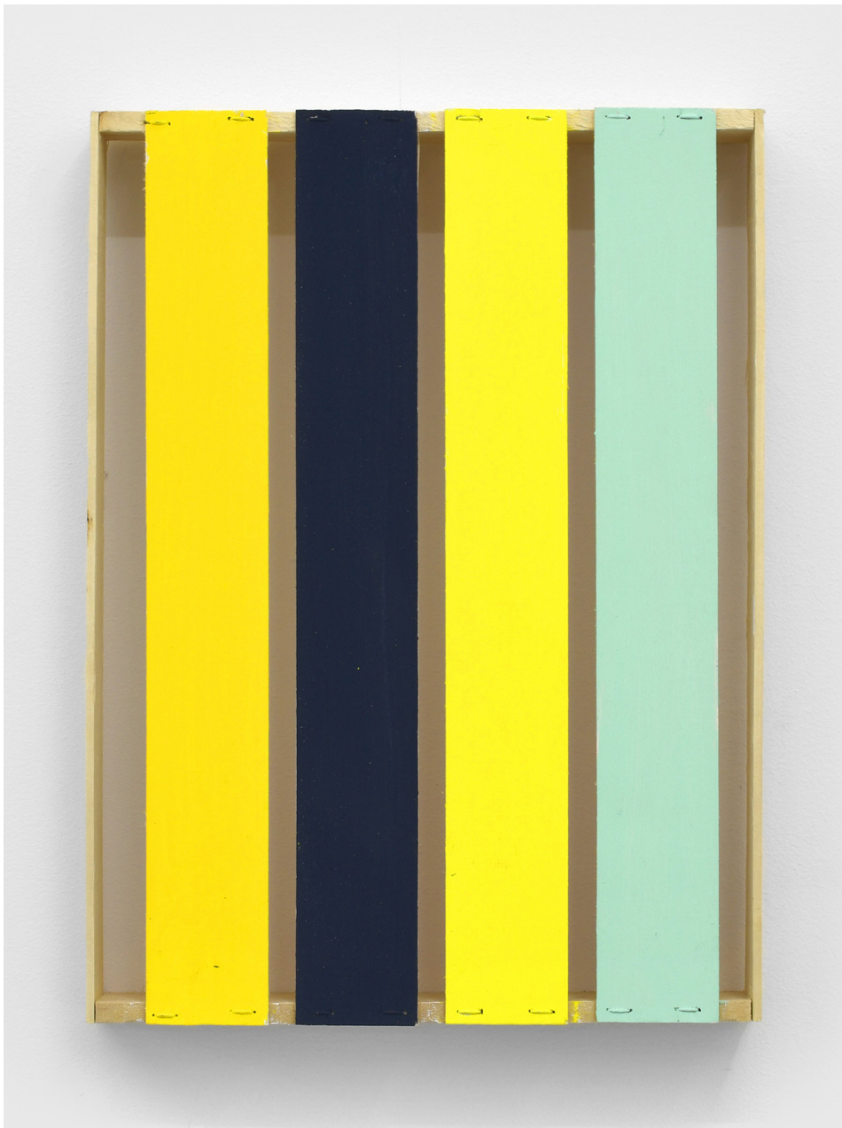
Bernard Villers, Cageot , 2019, Acrylic paint on wood, 39 x 29 x 4,5 cm