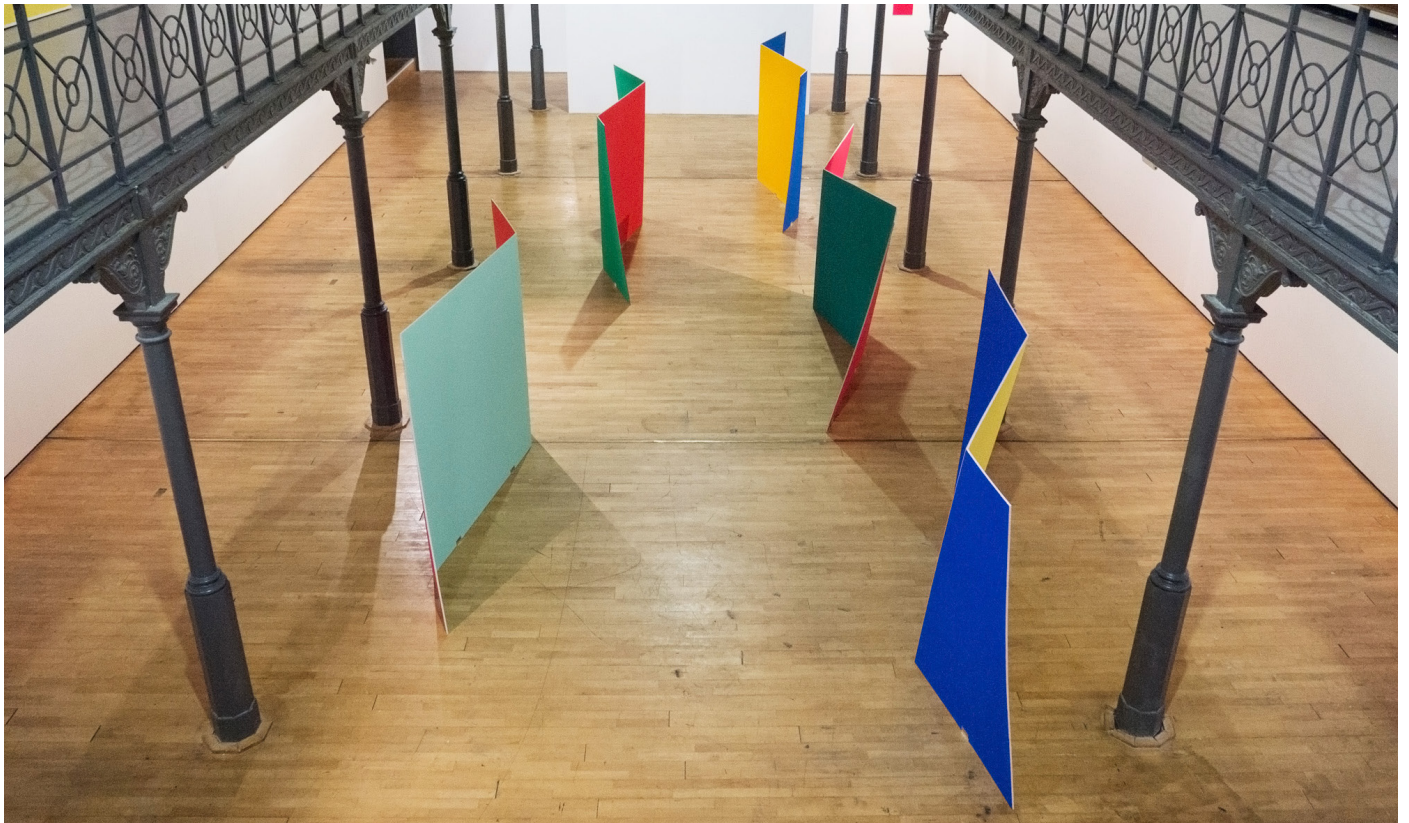
Bernard Villers, exhibition view of «La Couleur Manifeste» at Le Botanique, Brussels (BE), ©