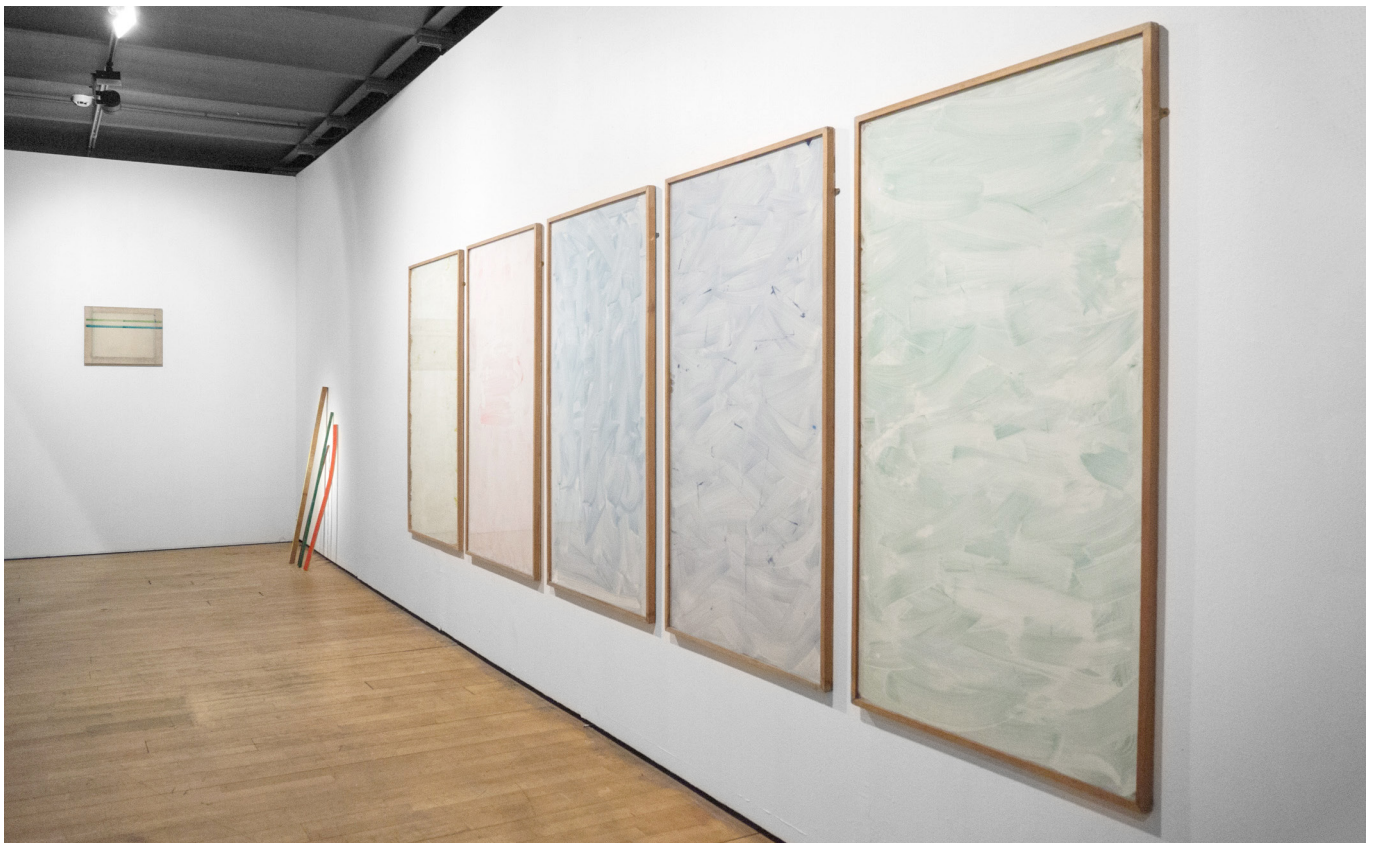
Bernard Villers, exhibition view of «La Couleur Manifeste» at Le Botanique, Brussels (BE)