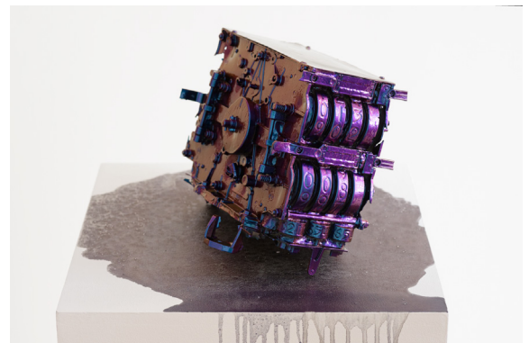
Jonathan Sullam, Inherent Drama , 2016, Plastic mold of engine and industrial paint