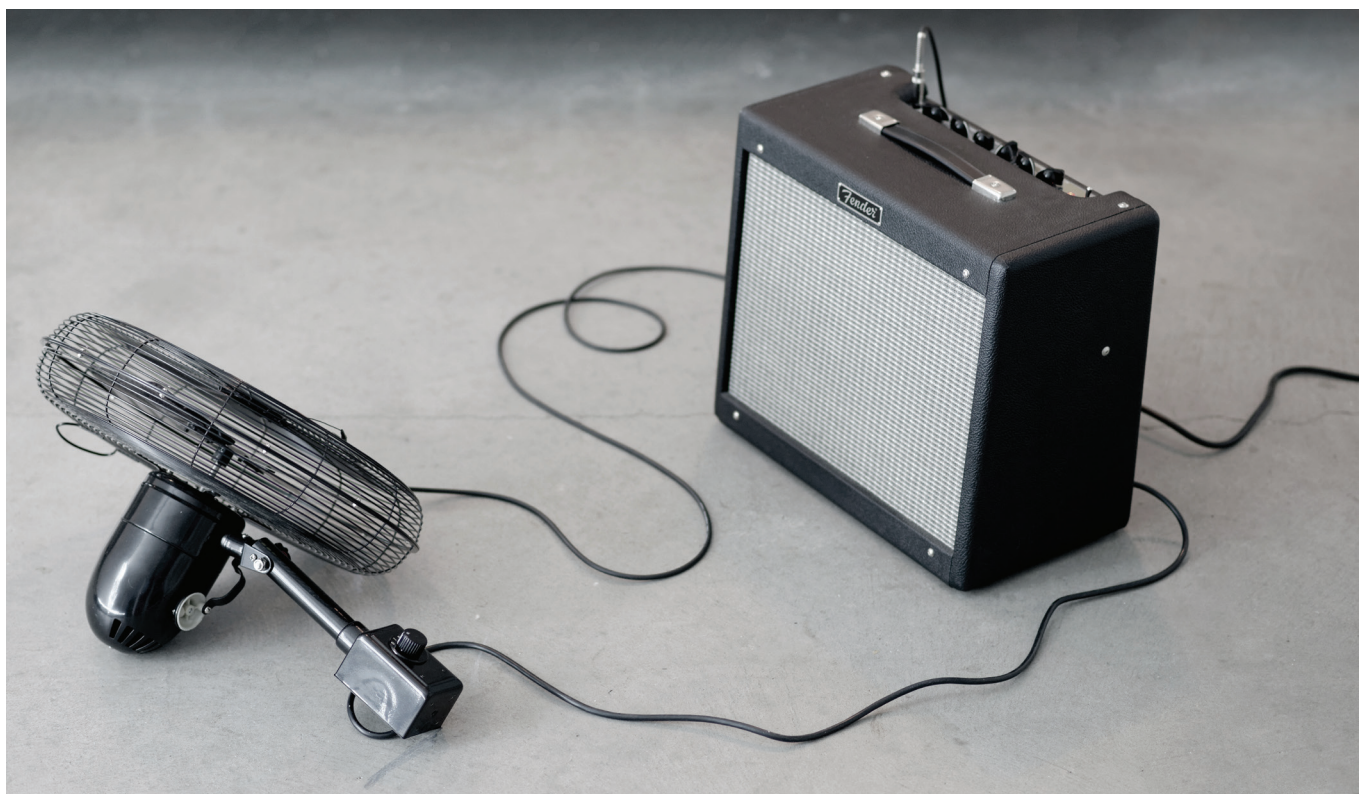
Jonathan Sullam, Sing a Song , 2014, Guitar amplifier, fan and piezzo microphone, 90 x 120 x 45 cm