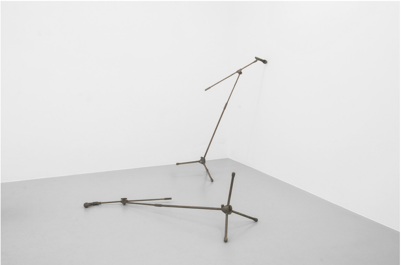
Jonathan Sullam, Talking loud saying nothing , 2018, Bronze microphones and stands, 184 x 50 x 50 cm each