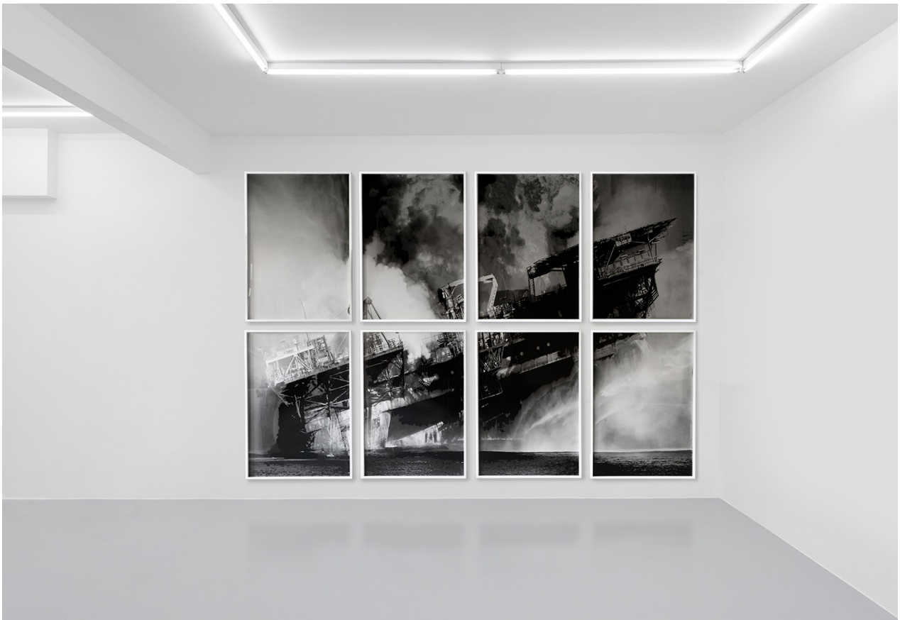
Jonathan Sullam, Not so distant , 2014, 8 Framed Multimedia silkscreen print, 300 x 220 cm (each)