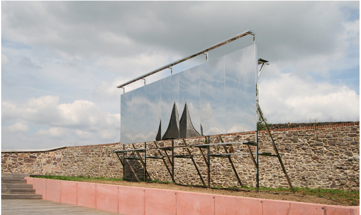
Jonathan Sullam, Board of bills - upward stance , 2015, Mirror polished aluminium structure and led system, 420 x 850 x 150 cm, Fluide-Mons 2015, Thuin (BE)