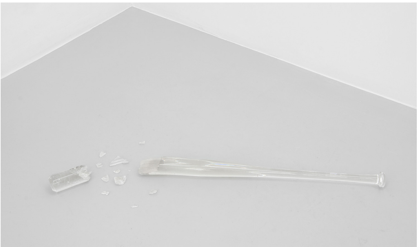
Jonathan Sullam, It's all going south from now on , 2014, Polished and broken glass, 110 x 7 cm