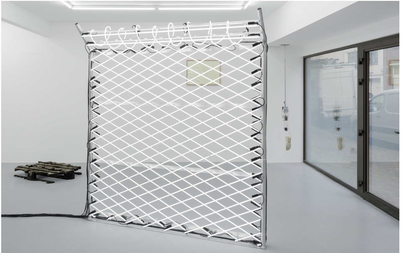
Jonathan Sullam, Knocking on heaven's door , 2017, Metal structure and neons, 200 x 230 cm Politics of discontent at Irène Laub Gallery Brussels (BE) 2018