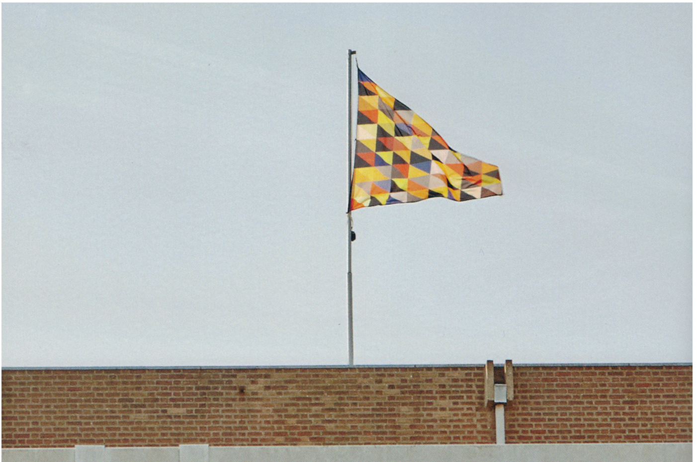
Athina Ioannou, The Three Musicians , Isosceles triangular form in the position of a flag, Colour composition, Cmyk print on transparent textile, 210x300cm, 2015, Cultuurcentrum Strombeek