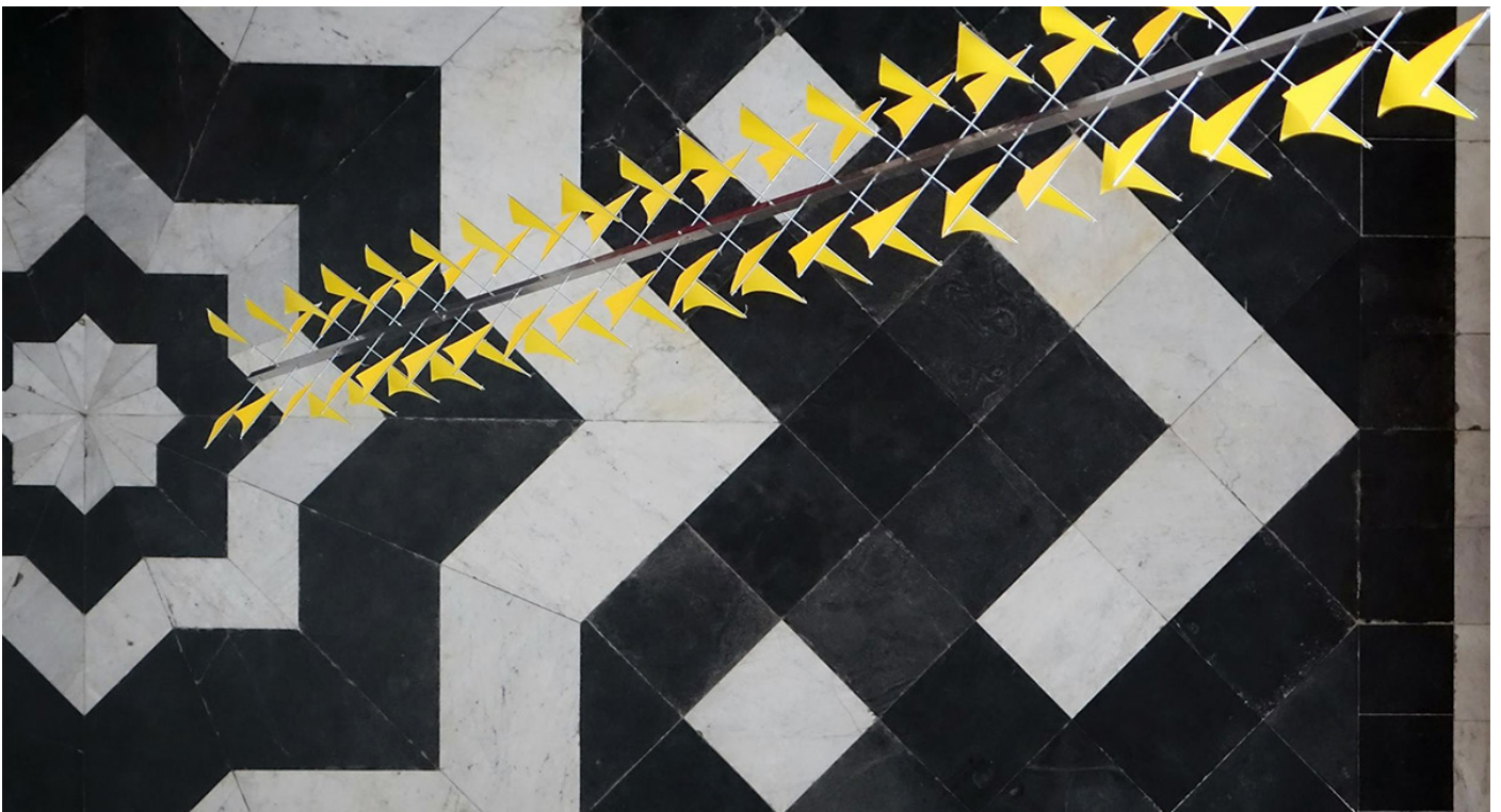
Exhibition view of Athina Ioannou, Onze Kerk , Abdijkerk Grimbergen, 2016