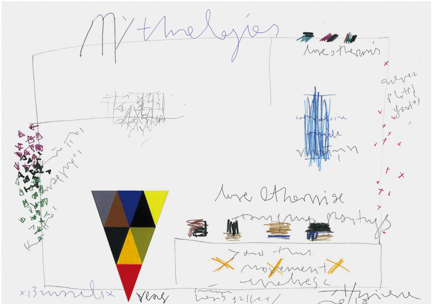
© Athina Ioannou, Mythologies, 2018, Collage and pencil on Fabriano Paper, 24 x 33 cm