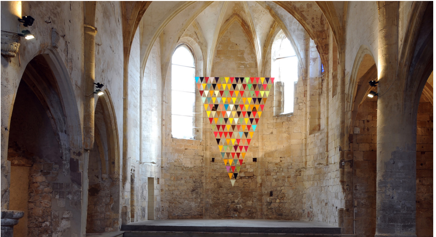
Athina Ioannou, Exhibition view of Resituations at Chapelle des Penitents (FR), 2010