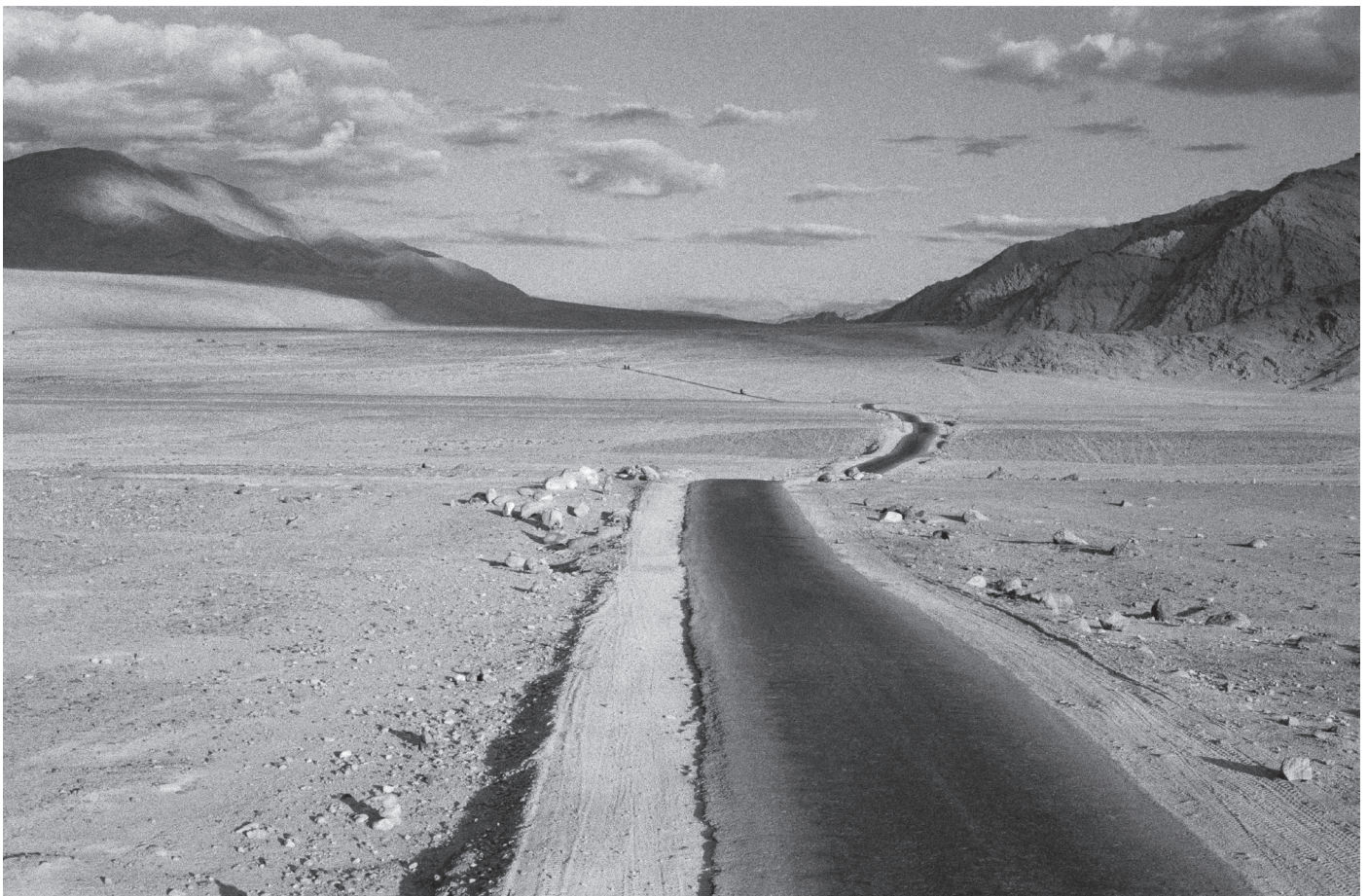
Rui Calçada Bastos, Untitled (Ladakh, Indian Tibet), 1991, Inkjet print, 23,9 x 35 cm