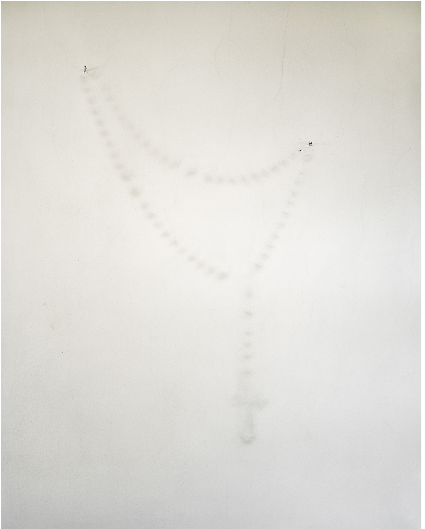
Rui Calçada Bastos, Ghost#3. 2016, Inkjet Print, 189 x 150 cm