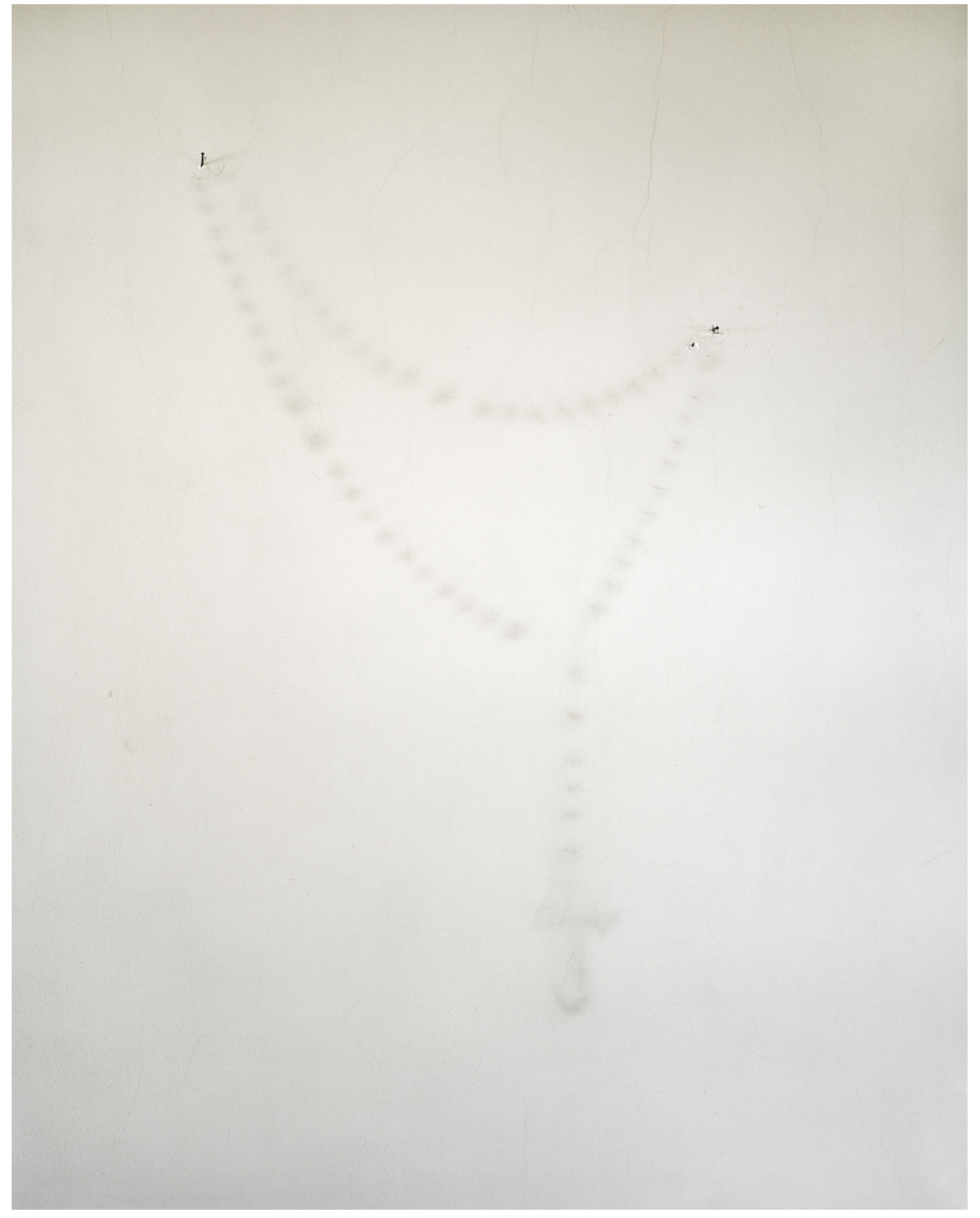
Rui Calçada Bastos, Ghost#3. 2016, Inkjet Print, 189 x 150 cm