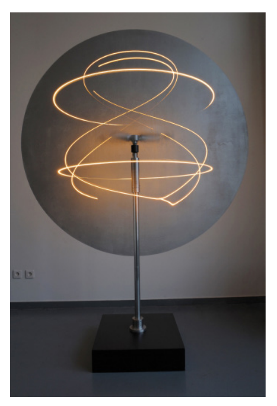
Laurent Bolognini, F-Vecteur 2, 2014, Carbon fiber, aluminium, electronic component, 4 bulbs, 180 x 70 x 70 cm

www.irenelaubgallery.com | Rue de l'Abbaye, 8b | 1050, Brussels, Belgium | +32 2 647 55 16